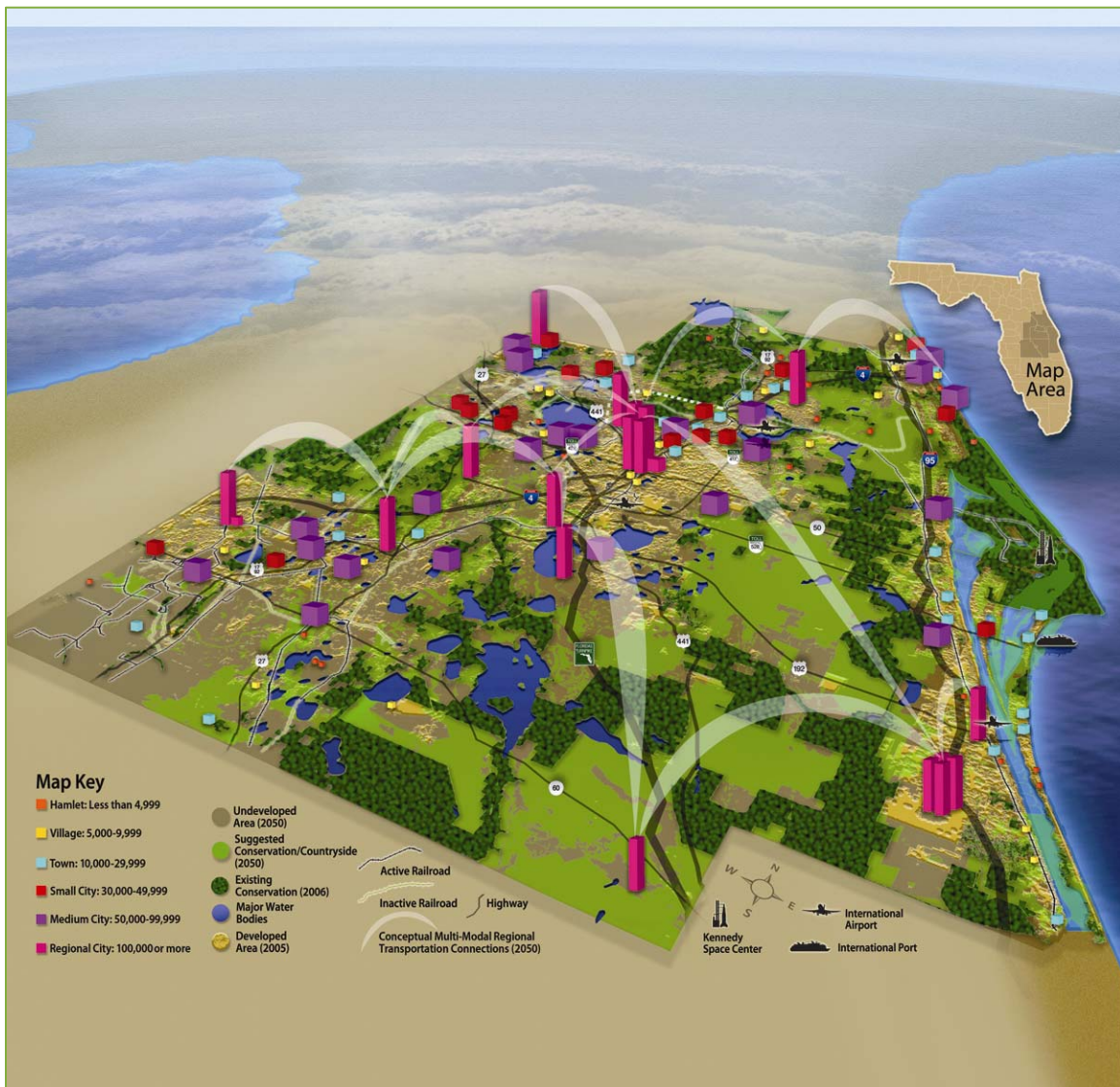
“How Shall We Grow?” A Shared Vision for Central Florida http://www.myregion.org/Portals/0/HSWG/HSWG_final.pdf

Between March 2006 and August 2007, nearly 20,000 Central Florida residents answered the question “How Shall We Grow?” through a series of community meetings, presentations and surveys. The result is the Central Florida Regional Growth Vision, which is a shared vision for how our region can grow between now and 2050, when the population is expected to more than double from 3.5 million to 7.2 million residents. With the resulting Compacts between and among all local governments in Central Florida, the Transportation Corridors Task Force should also work in the context of the Regional Growth Vision. Transportation corridors, assets, and multi-modal solutions are suggested in the projects overarching graphic, below.